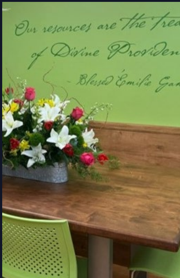
Table of the King

The Table of the King honors the legacy, the dedication, and the life of Blessed Emilie Gamelin, the Foundress of the Sisters of Providence.